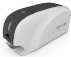
Single sided ID CARD PRINTER smart-31S