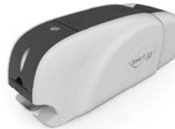
Dual sided ID CARD PRINTER smart-31D