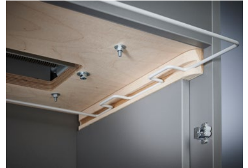
Dahle Office 50564 document shredder