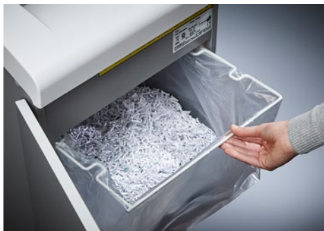
Dahle Office 50564 document shredder