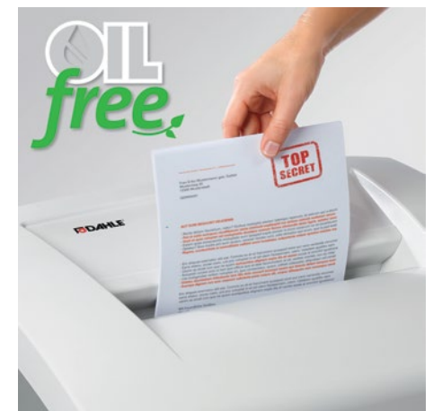
Shredding the convenient way, all without the time-consuming process of oiling the cutters