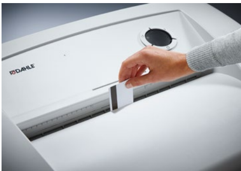
Dahle Office 50564 document shredder