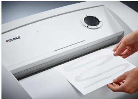
Dahle Office 50564 document shredder