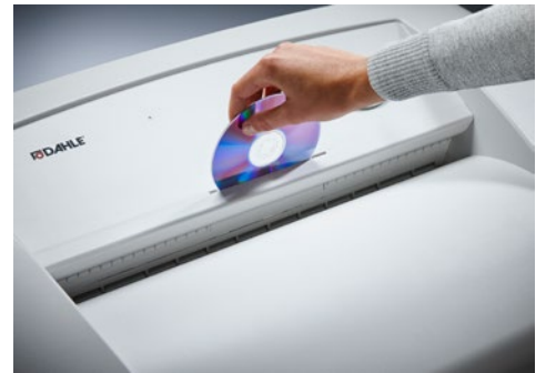
Dahle Office 50564 document shredder