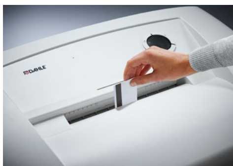
Dahle Office 50514 document shredder