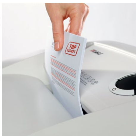
Innovative MHP technology® shreds up to 30 % more paper