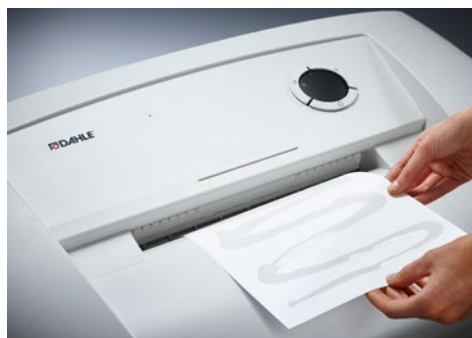
Dahle Office 50514 document shredder