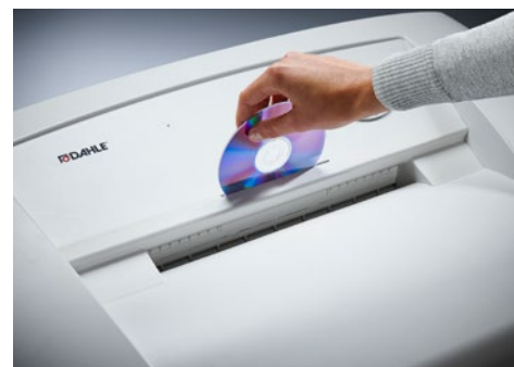
Dahle Office 50514 document shredder