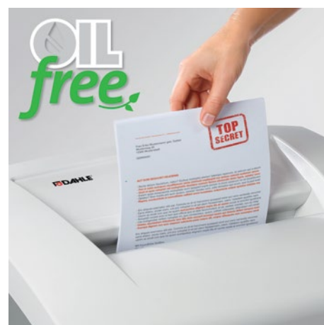
Shredding the convenient way, all without the time-consuming process of oiling the cutters