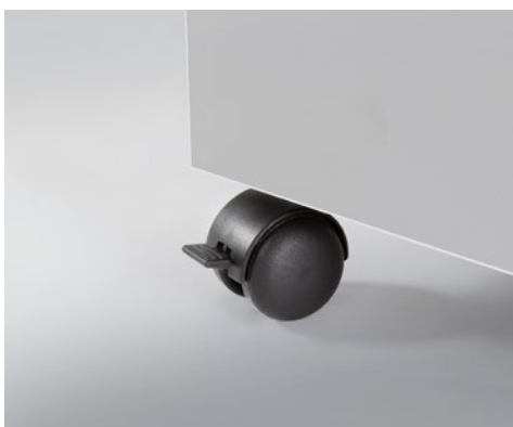
Practical swivel casters for flexible use